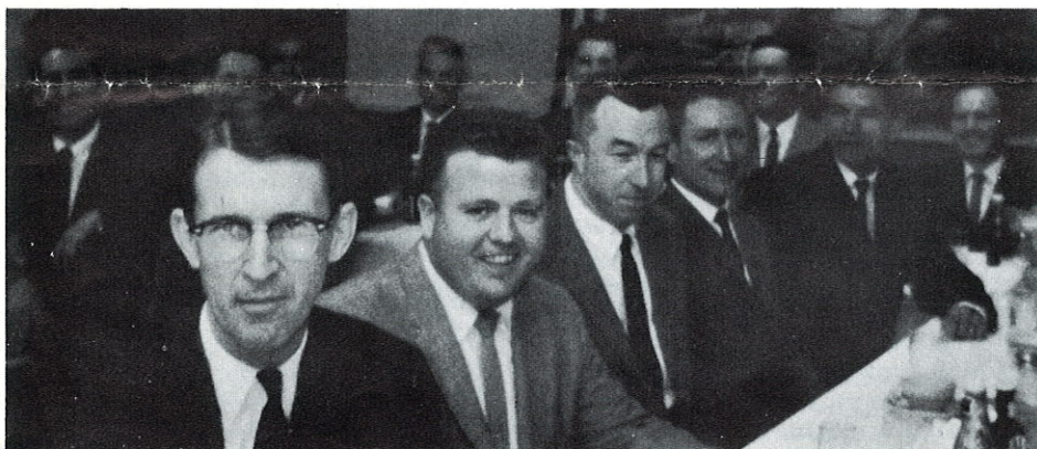
Corpus Christi — San Antonio and Houston Spokesman Clubs in Joint Meeting.